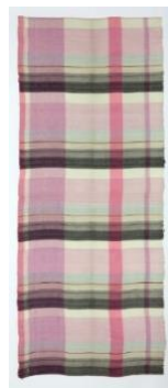
Gunta Stölzl, Decoration fabric no. 539 1926 cotton, viscose, chenille, plain weave 227.5 x 89.5 cm Die Neue Sammlung – The Design Museum, Munich