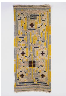
Johannes Itten, Picture Rug

Zurich University of the Arts / Museum für Gestaltung Zürich / Decorative Arts Collection