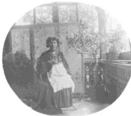
Sophie Taeuber with embroidery hoop Trogen, 1905 vintage gelatin silver print 6.5 x 5.7 cm Private collection