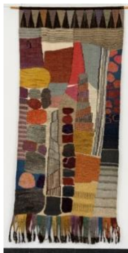
Gunta Stölzl, Getürmt 1973 wool, cotton, needlepoint 240 x 110 cm Municipality of Küsnacht ZH

Images are available here for free download. When using the image material, we kindly request that you always include the information below: