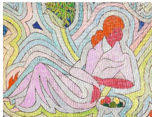
Johannes Itten, Woman with the Birds