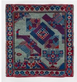
Johannes Itten, Rug