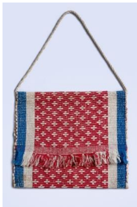
Gunta Stölzl, “Landitasche” bag for the Swiss National Exhibition (Landi) 1939 rib weave cotton 20 x 24 cm Private collection

Kunstmuseum Thun Thunerhof, Hofstettenstrasse 14, 3602 Thun T +41 (0)33 225 84 20 / F +41 (0)33 225 89 06 kunstmuseum@thun.ch, www.kunstmuseumthun.ch